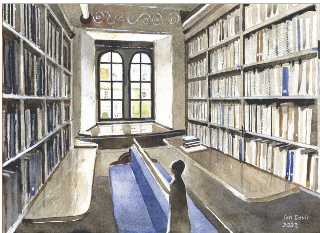
2 College Library (1604) 30cm x 40cm, signed, edition of 20