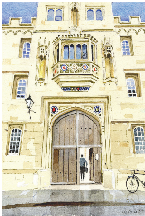
3 Merton Street Facade (1517) 40cm x 30cm, signed, edition of 20