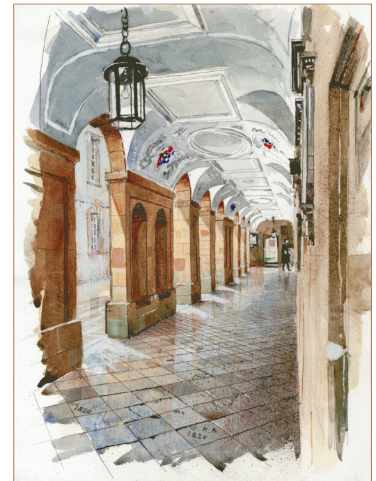
6 Cloister (1712) 40cm x 30cm, signed, edition of 20