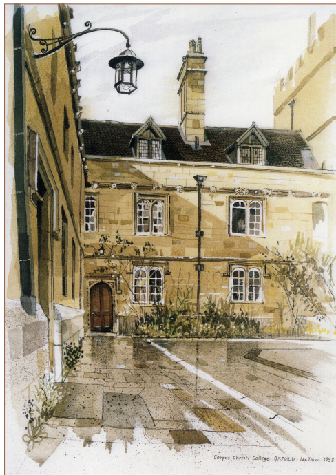
4 Front Quad (1517) 40cm x 30cm, signed, edition of 20