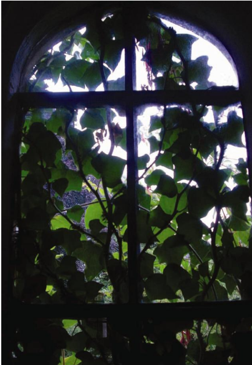
View from a window in the Library. (David Leake)