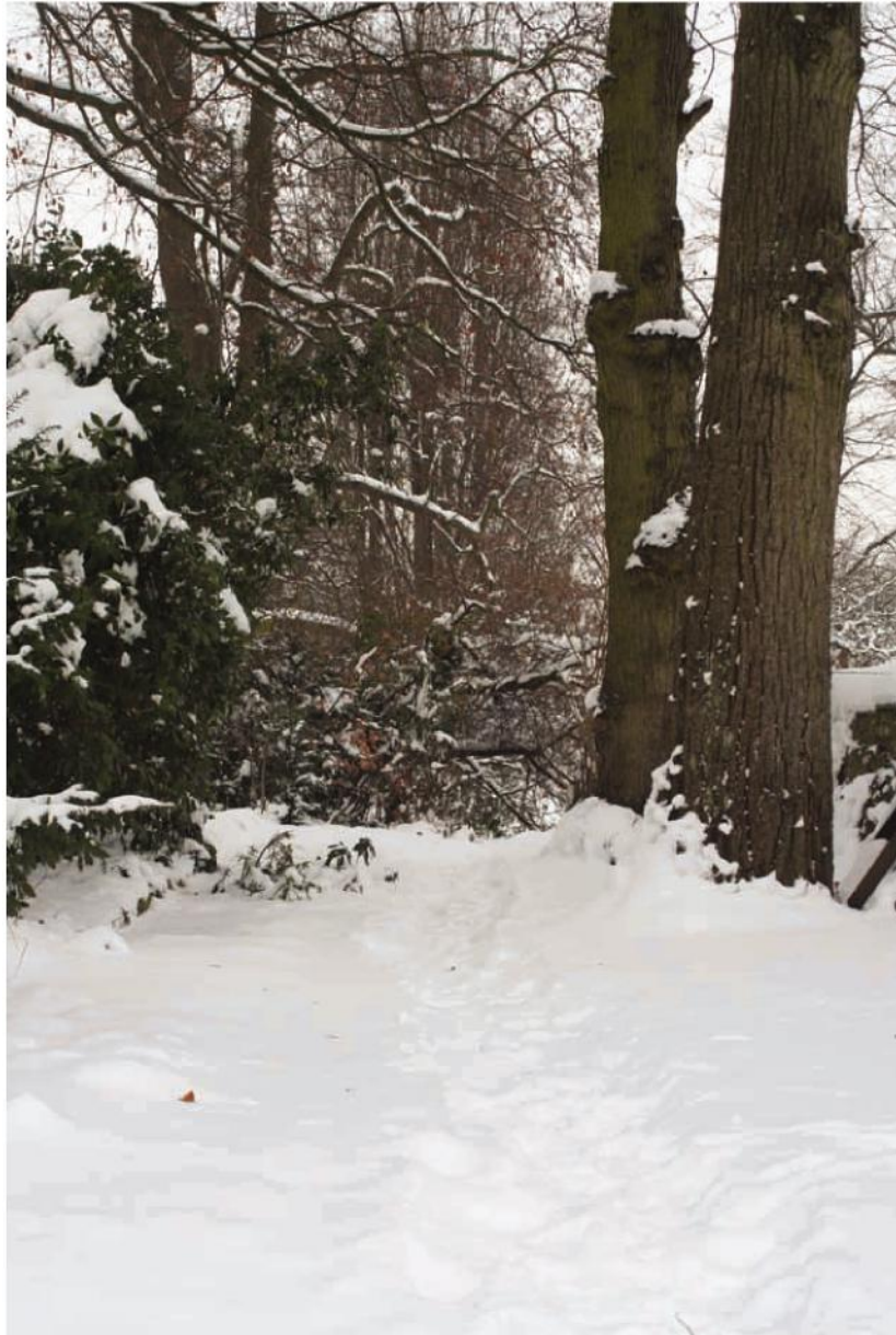
Corpus' garden in the snow, December 2010