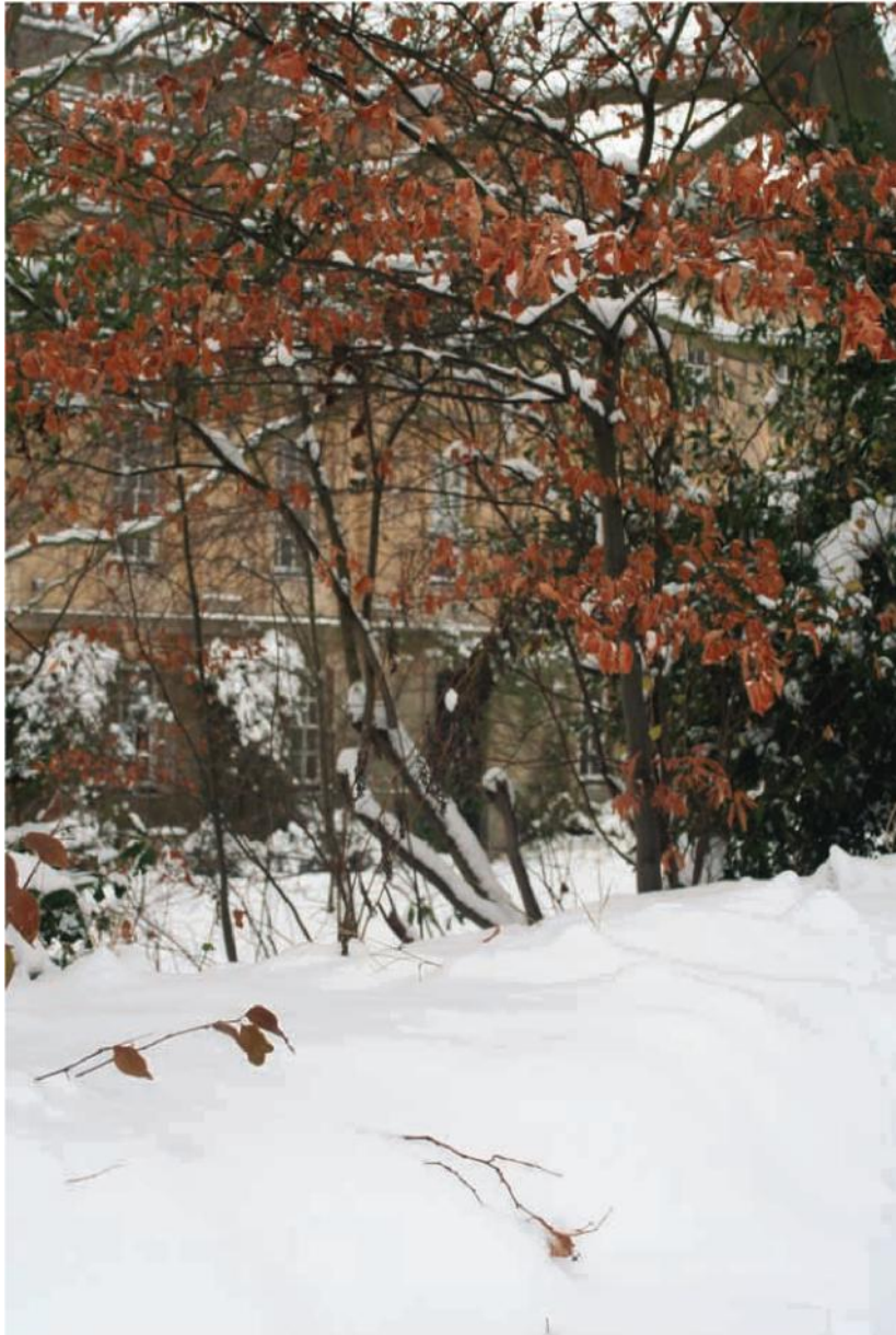
Fellows' Building, December 2010.